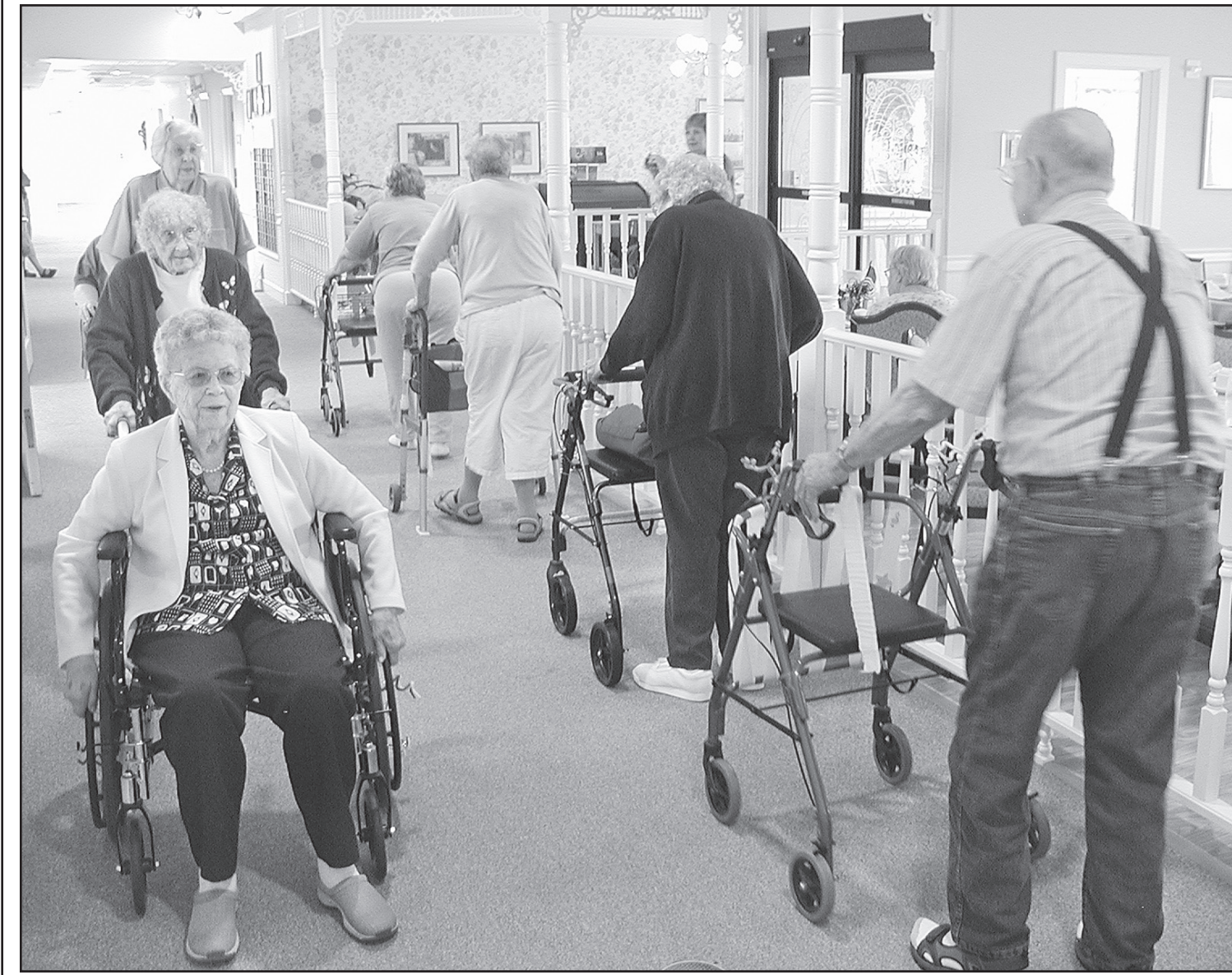
Residents at Wheatridge Acres celebrated National Walker and Wheelchair Beautification month with a parade on Friday. The walkers and wheelchairs were decorated by the staff.