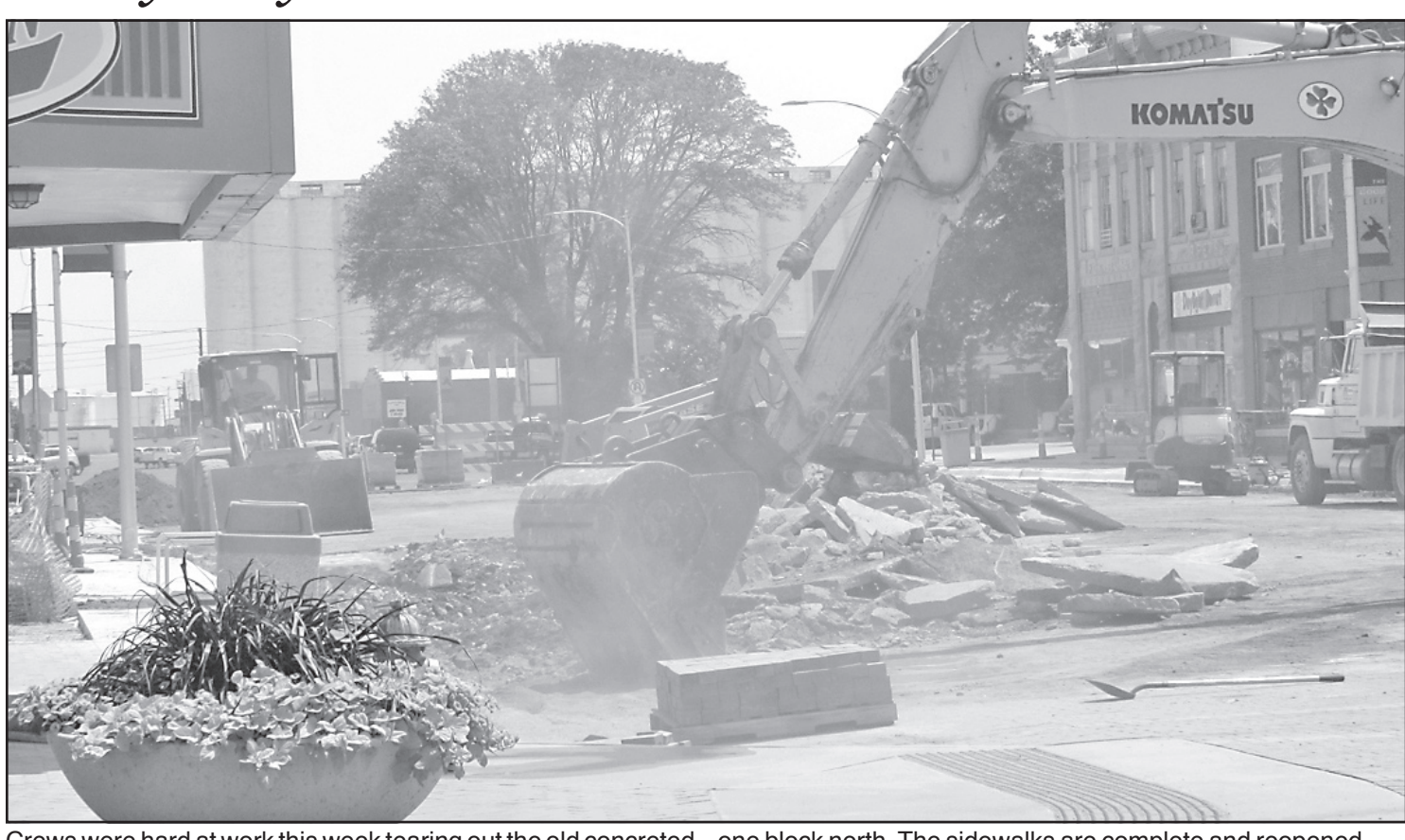
Crews were hard at work this week tearing out the old concreted one block north. The sidewalks are complete and reopened. on Main Avenue from 12th to 13th Streets. Brick work continues