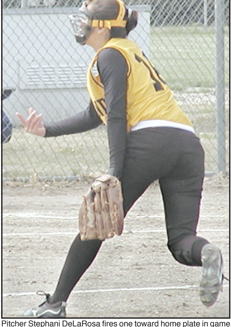
one of the doubleheader against Garden City on Tuesday.

At the top of the second inning Garden City had three up and three down. Goodland remained scoreless in the bottom of the second as well. Garden city led, 1-0.