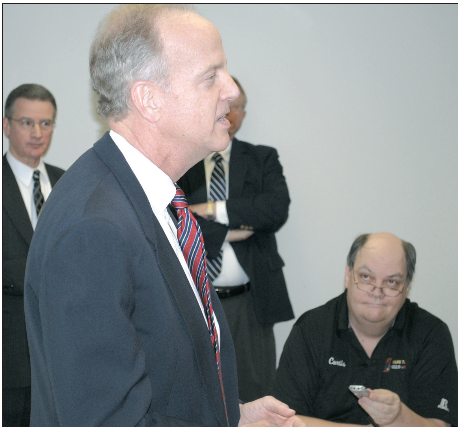
Sen. Jerry Moran spoke at the kickoff for the public phase of the hospital foundation's fund raising campaign. Moran said he is a supporter of local health care, because it is essential for maintaining the rural way of life.