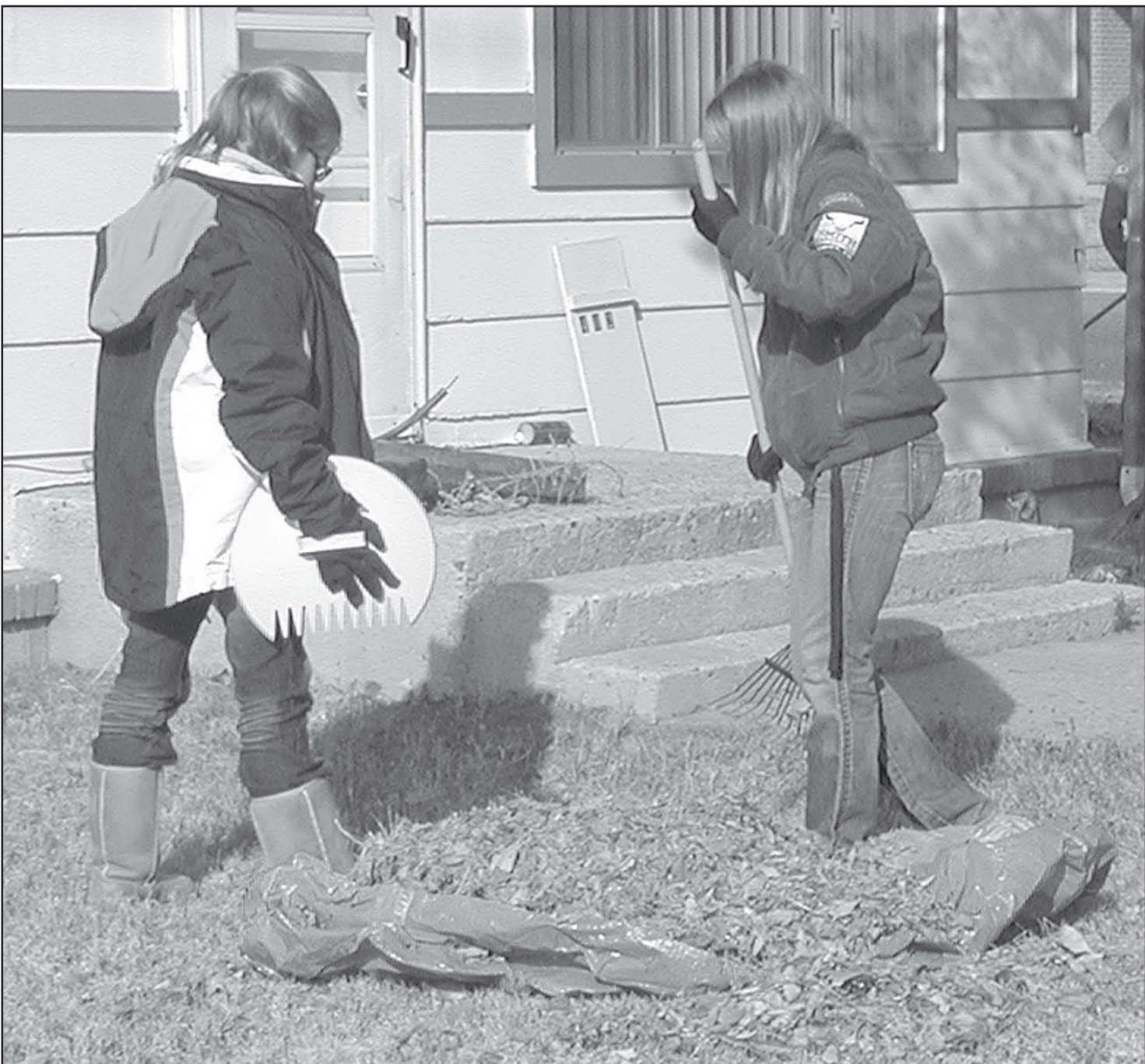
Two of the Goodland High School students who helped rake and clean up yards on Wednesday in their Goodland Fall Cleanup. Students divided up into 14 groups to do this community project of the school.