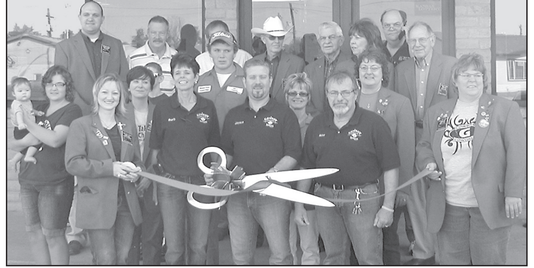
The Goodland Star-News and the Goodland Ambassadors would like to welcome Cowboy Corner Xpress to downtown Goodland!

Cowboy Corner Xpress opened for business on September 1, 2011. The Grand Opening and Ribbon Cutting was held on September 24, 2011. Cowboy Corner Xpress wants to thank the community for their support and patronage.