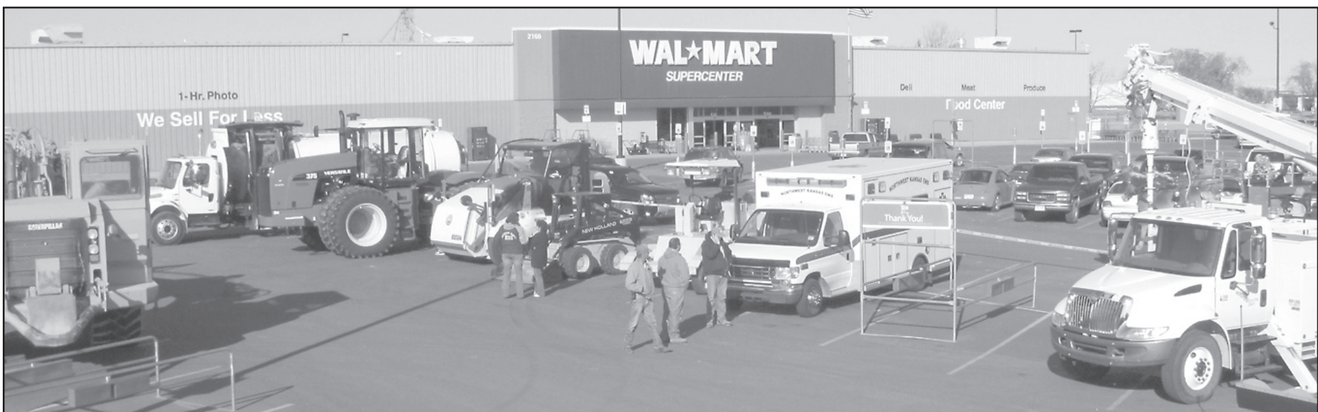
The south half of the Goodland Walmart parking lot was filled with trucks of every size, construction equipment, emergency vehicles and a variety of other types of vehicles to give kids of all ages a chance to Touch-a-Truck.