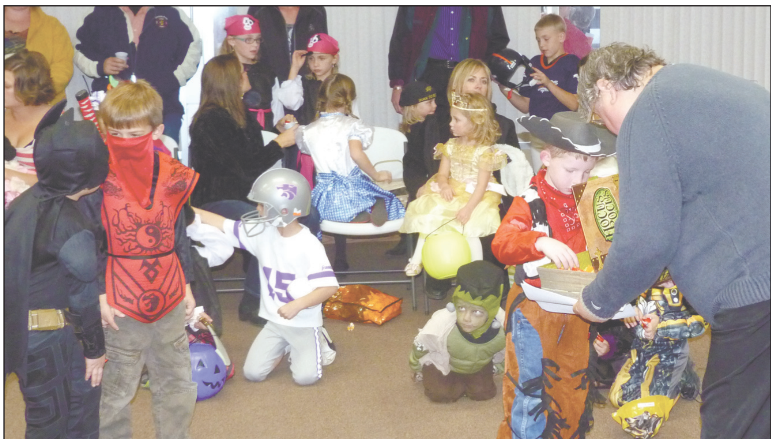
Kids with all kinds of Halloween costumes came to the 10th Annual Moonlight Madness Merchants Costume Contest. A total of 72 entered the three age groups and each one was called forward to show off for the judges and get a piece of candy.

Businesses sponsoring Moonlight Madness include Carnegie Arts Center, 120 W. 12th; Gambino's, 402 E. 17th; Dan Brenner Ford, 224 W. Business U.S. 24; T&J Wireless, 1018 Main; Cowboy Corner Express, 1613 Main; Z Wireless 716 W. Business U.S. 24; High Plains Museum, 1717 Cherry Ave.; Walmart, 2160 Commerce Road; First Baptist Church, 1121 Main; and The Goodland Star-News , 1205 Main.