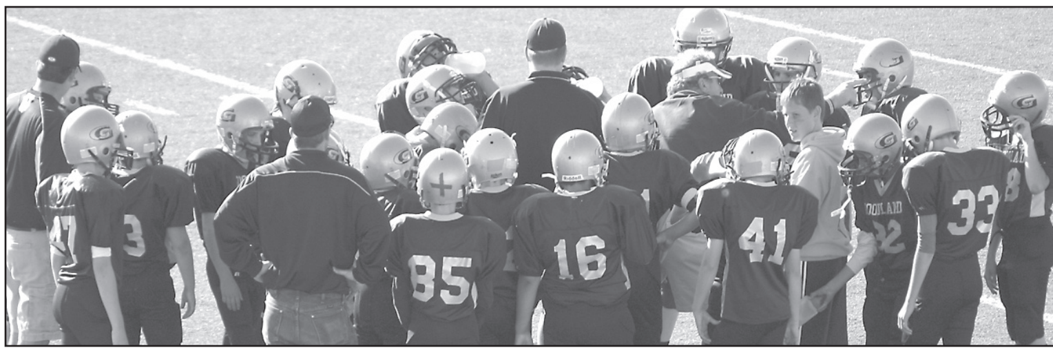
Sixth grade Junior Cowboys gather with their coaches at the playoff game in Hays. The team will play again at 4:30 p.m. Saturday.