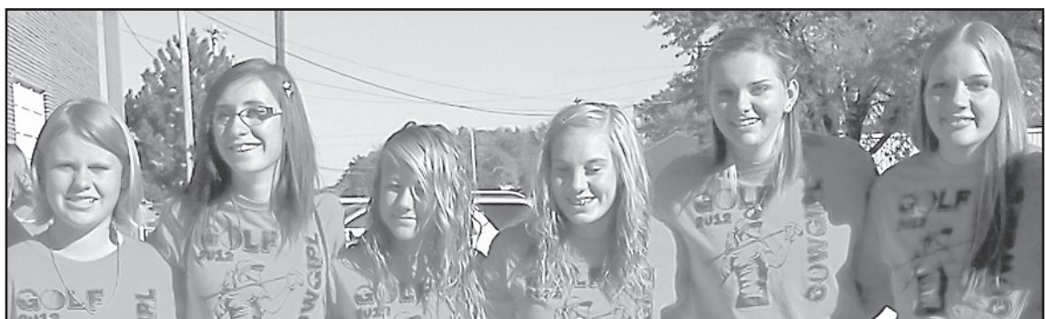
Cowgirls golf team finished sixth at the 3-2-1A state tournament at Emporia on Monday.