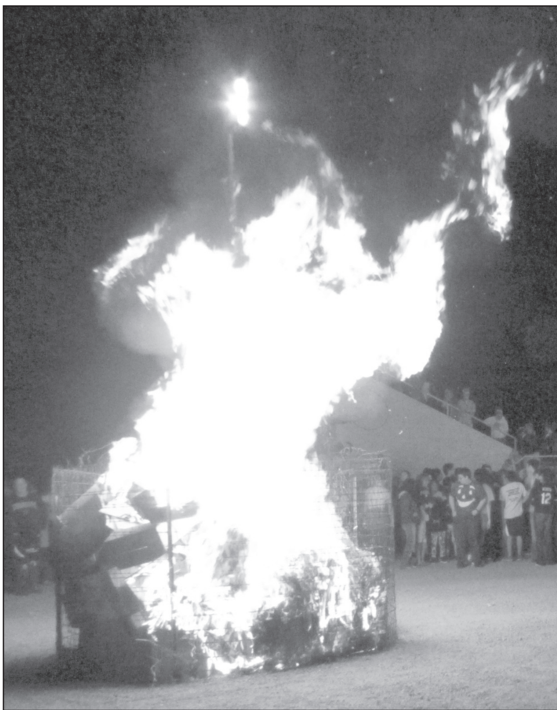
A ghostly figure appeared in the homecoming bonfire letting the Cowboys know they were going to be victorious over the Lakin Broncs, and the winning continued on Friday at Colby. The Cowboys will be in Norton on Friday to try to extend the winning streak to three games.