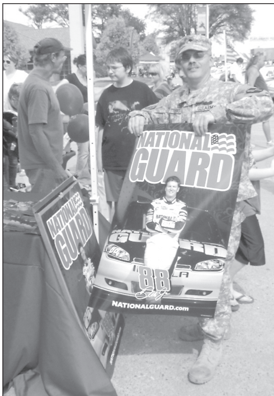
Kansas National Guardsmen were kept busy rolling up and handing out the special posters of Dale Earnhardt, Jr. during the 25th Annual Flatlander Festival on Main Ave. The special display was on the Kansasland parking lot and allowed people to see the race car and have their photo taken in front of the car as well as collecting the posters. The Kansas National Guard was able to get the special display because the National Guard is Earnhardt's sponsor. The Kansas National Guard is hoping to bring a special Victory motorcycle for display at next year's Flatlander Festival.