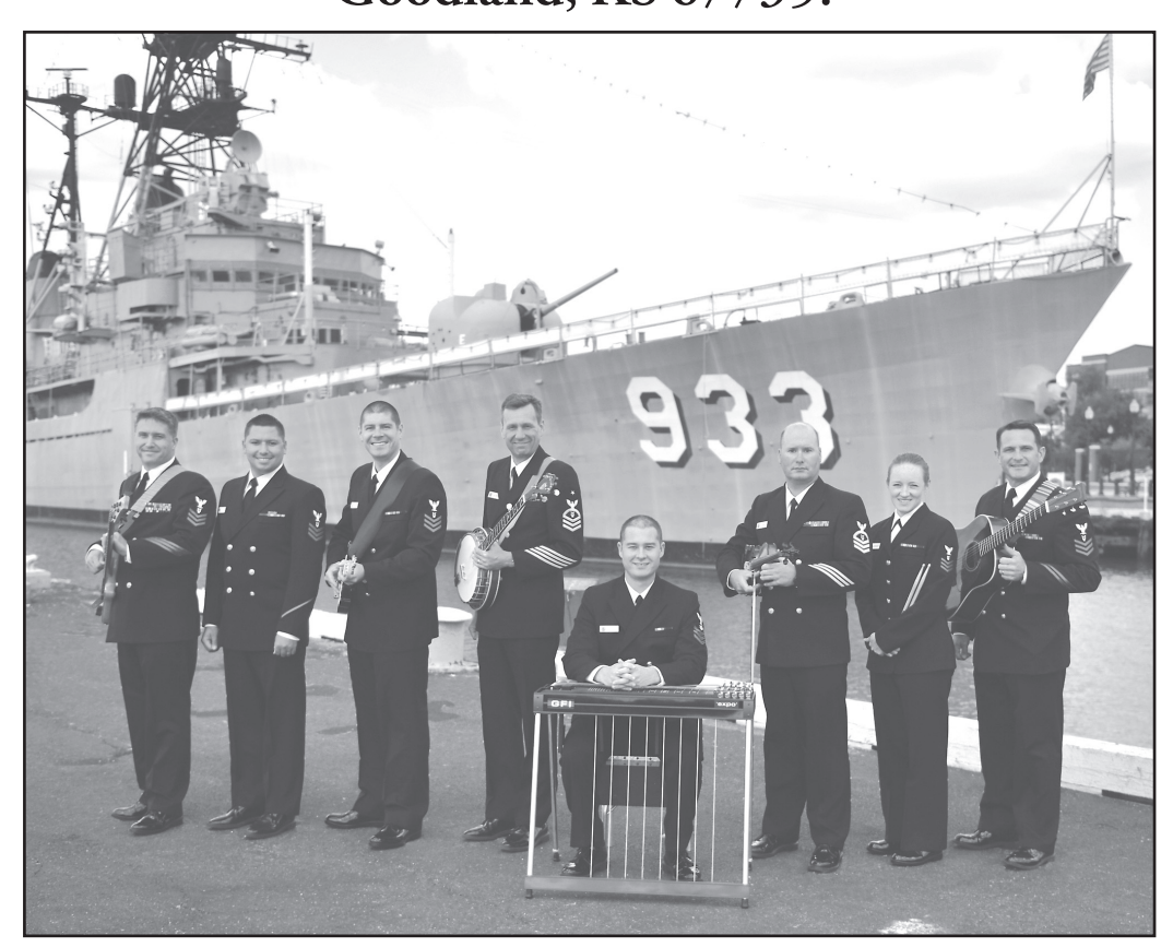
Sponsored by The Goodland Star-News and Goodland School District

Free concert tickets available for pick-up at The Goodland Star-News, 1205 Main, Goodland, or by sending Self-Addressed Stamped envelope to COUNTRY CURRENT, 1205 Main, Goodland, KS 67735.