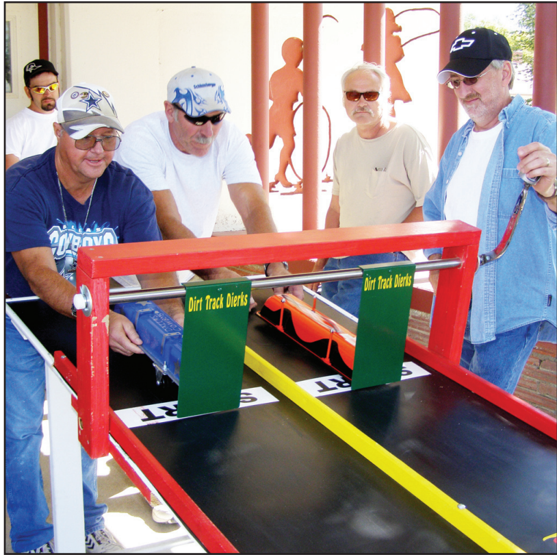
Returning this year are the popular valve cover races to be held in the early afternoon on Saturday, Sept. 24 at Central Elementary. The special track was built by Big Twin Auto, and NAPA sponsors the races.