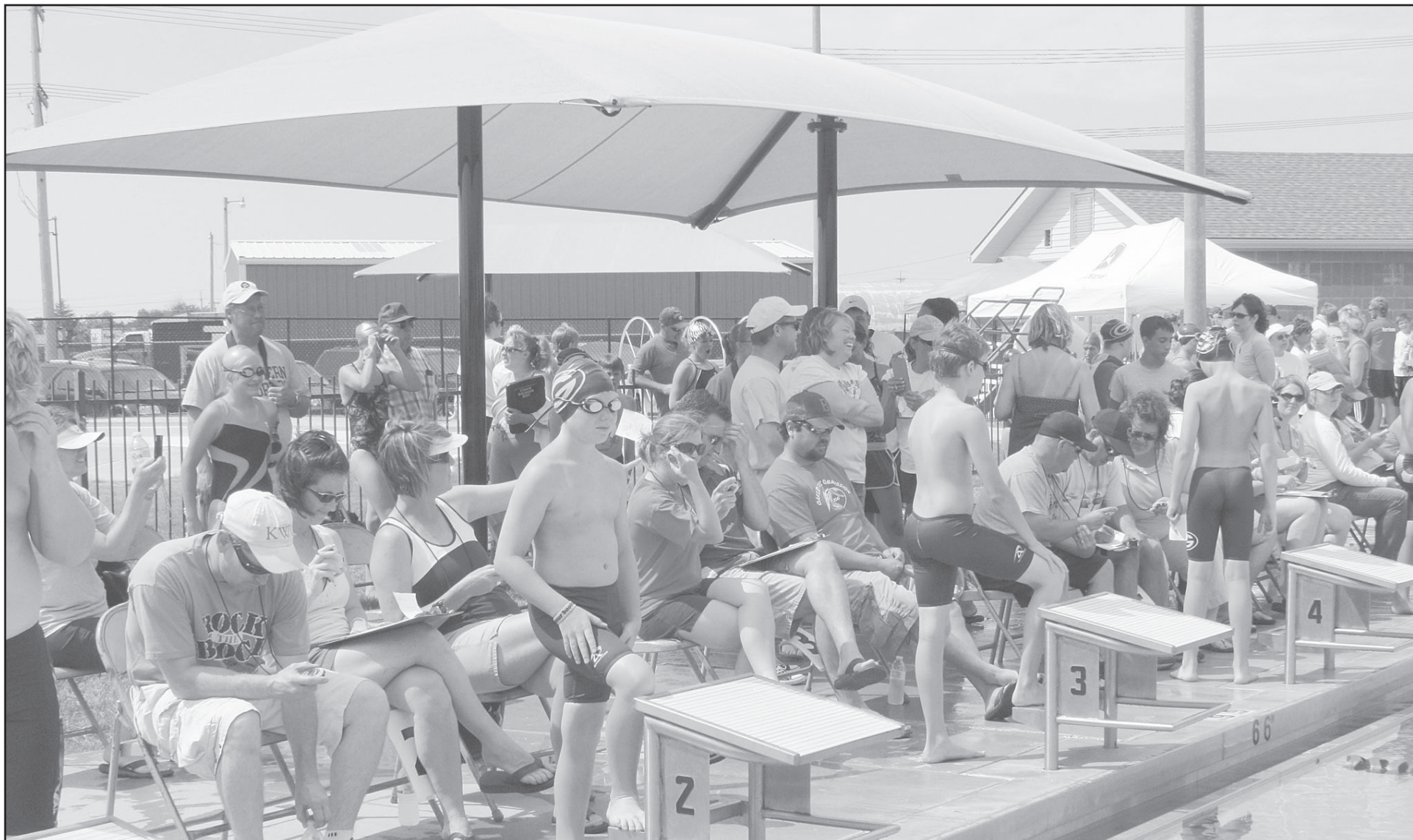
One of the canvas shade shelters at Steever Water Park at the home swimming meet over the 4th of July weekend. The shelters were the community project for Brendan Fulcher's Eagle Badge.