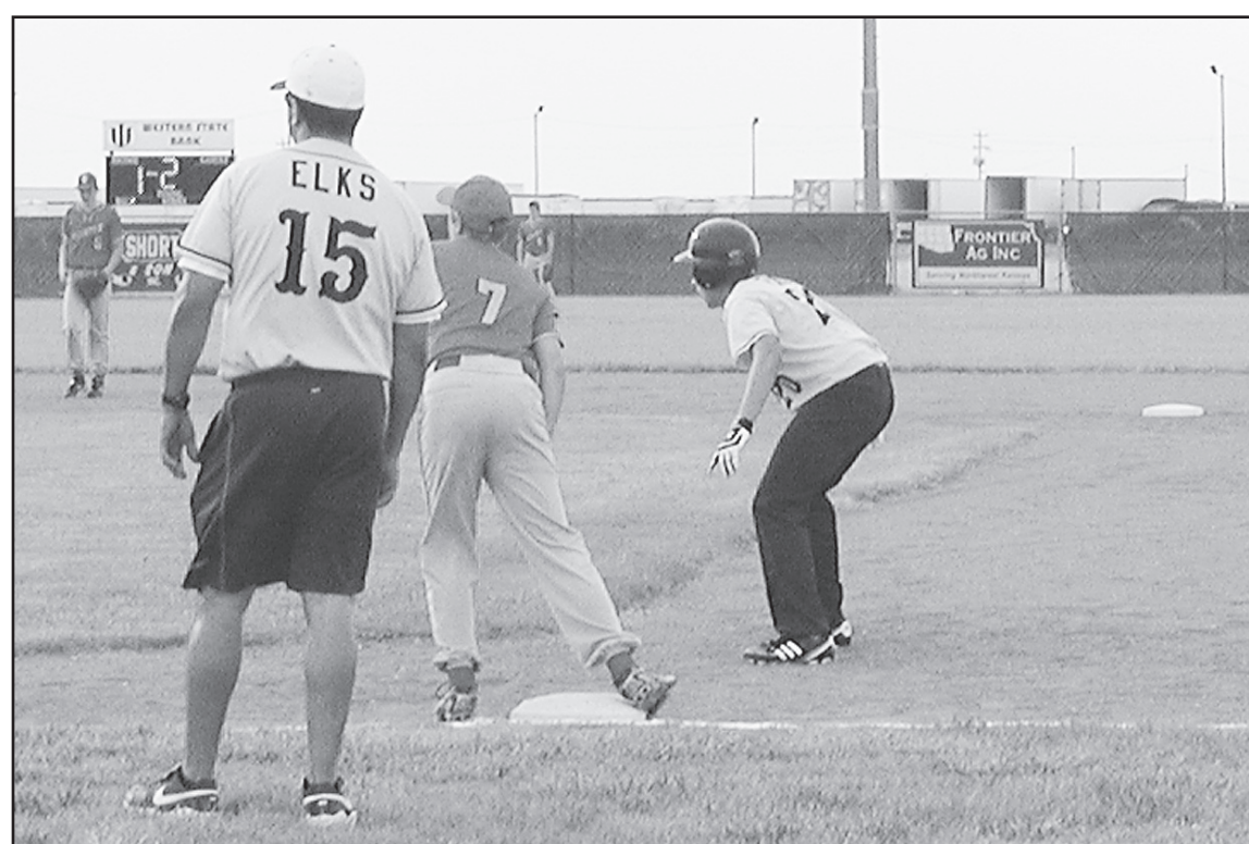
An Elks K-18 player takes a lead off first base in the first game Thursday against Quinter. The Goodland team won the first game 5-3, but lost the second 7-4.