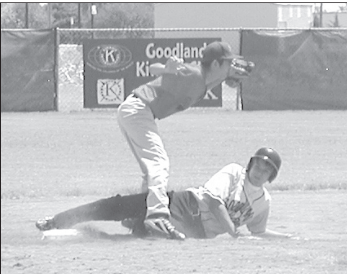
Goodland K-18 Elks baseball team played Garden City on Saturday. A player on first tried to steal second and was out. Another player hit a fly and was out at first. They lost the first game 13-2.