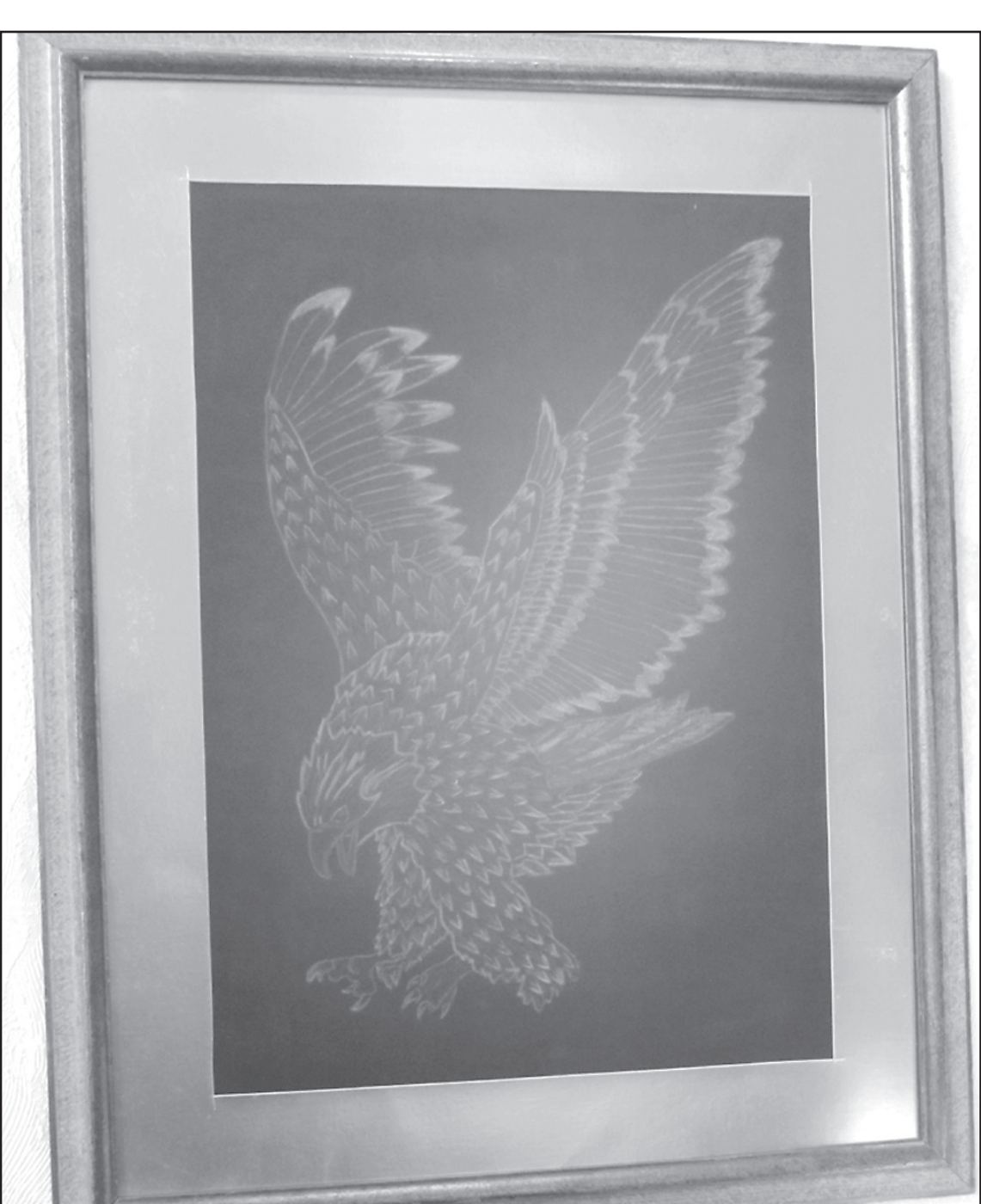
Exhibit shows until June 26 by Denver artist