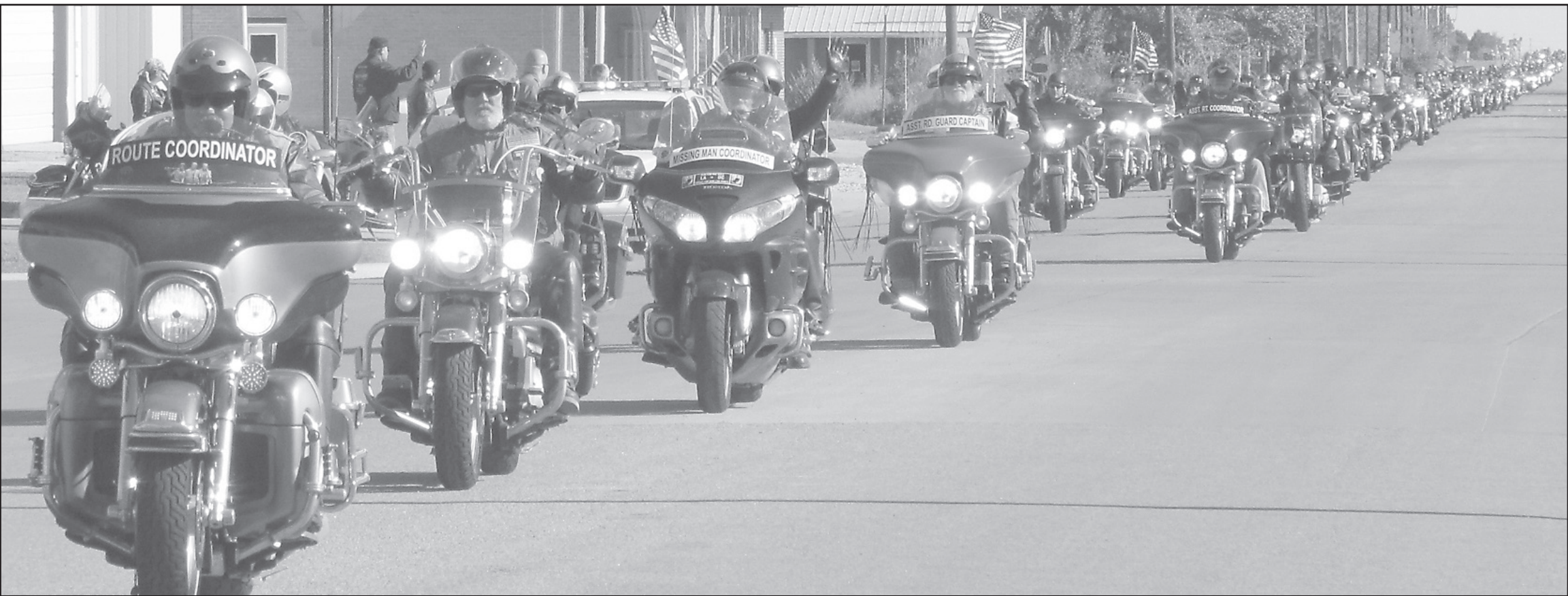
Run for the Wall bikers lined Caldwell Ave. Sunday morning as the more than 300 riders headed east out of Goodland on the next lap of their journey to Washington, D.C. for the XXIII annual Rolling Thunder procession to be held on Sunday from the Pentagon down to the Vietnam War Memorial where there