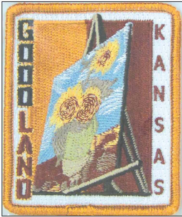
Special Goodland patch the Sherman County Convention and Visitors Bureau will hand out to the Run For The Wall riders who come to town on Saturday.

The city has proclaimed Saturday as "Run For The Wall Day" and declared it "an appropriate day for the Kiwanis Club to include as a part of their flag project."