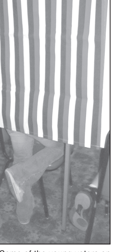
Some of the young voters on Tuesday needed a little help from a chair to reach the shelf to mark their ballots. The Kids Vote was quite popular with 182 voting.

In the results the kids voted down the Goodland School District bond issue with 80 Yes and 102 No. The kids were more in favor of the bond