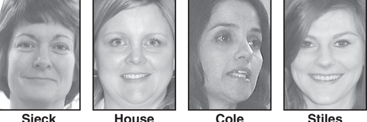
Sieck House Cole Stiles