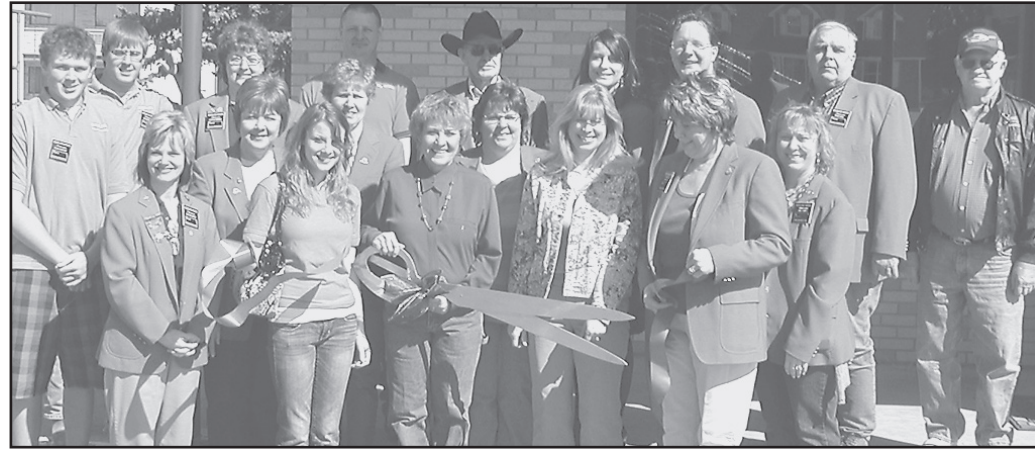
The Goodland Star-News and the Goodland Ambassadors would like to welcome Shiraz!

Goodland's newest restaurant is now open and ready for business! Shiraz, located on Highway 24, is the former home of a Chinese restaurant.