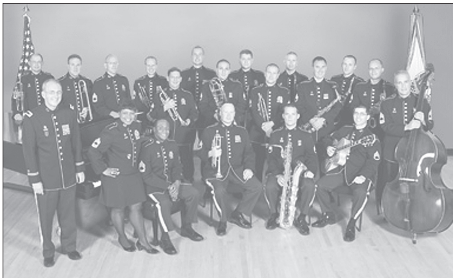
The U.S. Army Jazz Ambassadors

The band has appeared in all fifty states, Canada, Mexico, Japan, India, and throughout Europe. Notable performances include concerts at international jazz festivals in Montreux, Switzerland; Newport, Rhode Island; Toronto, Canada; Brussels, Belgium; and the North Sea Jazz Festival in the Netherlands. In 1995, the Ambassadors performed in England, Wales, Belgium Luxembourg, and the Czech Republic in commemoration of the 50th anniversary of the end of World War II. The band has also been featured in unique joint concerts with major orchestras, including the Detroit and Baltimore symphonies.