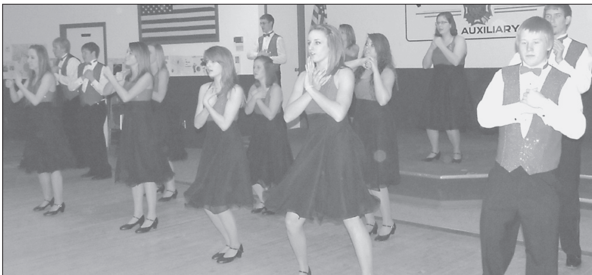
Goodland High School's Xpressos were busy on Monday doing singing for Valentines Day and in the evening the signing group entertained for the crowd at the 67th Annual Sherman County Conservation District banquet held at the Veterans of Foreign Wars Hall.