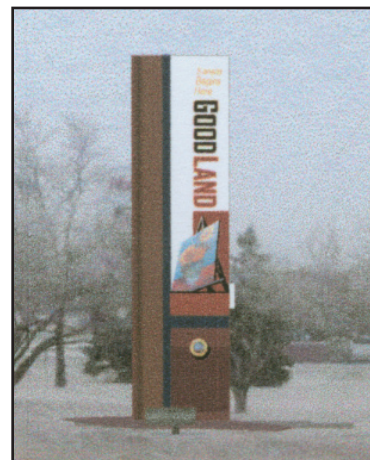
Three proposed signs presented by Leon Volk of Commercial Sign. The proposed signs would be located on the right of way to the west of Orscheln and Herl Chevrolet. The top sign is similar to the one at Pioneer Park and is estimated to cost $7,625. The second sign would be $6,085 and the vertical pylon sign would cost $7,500. The Commissioners are looking at several places to put signs.

image and use it on all the related signs like a brand for the city.