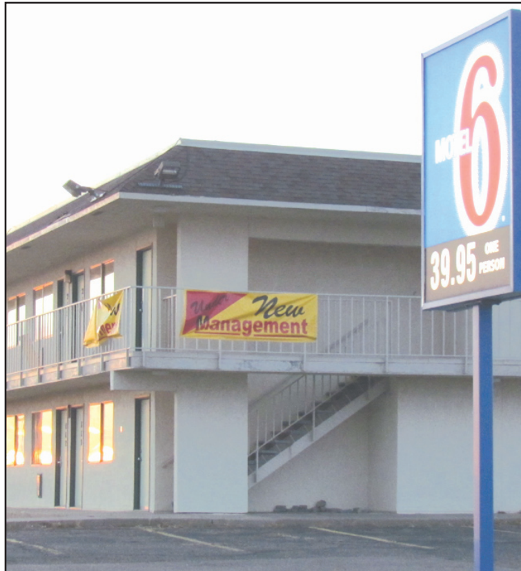
Lights are back on at Motel 6 on Commerce Road, and plans were presented to the city for more renovation and improvements.