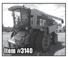
Item #3140 '99 CAT LEXION 480 RWA

purplewave.com Aaron McKee TX Lic #16401 | 10% buyers premium applies