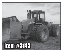
Item #3143 '06 NH T3375 4WD w/blade