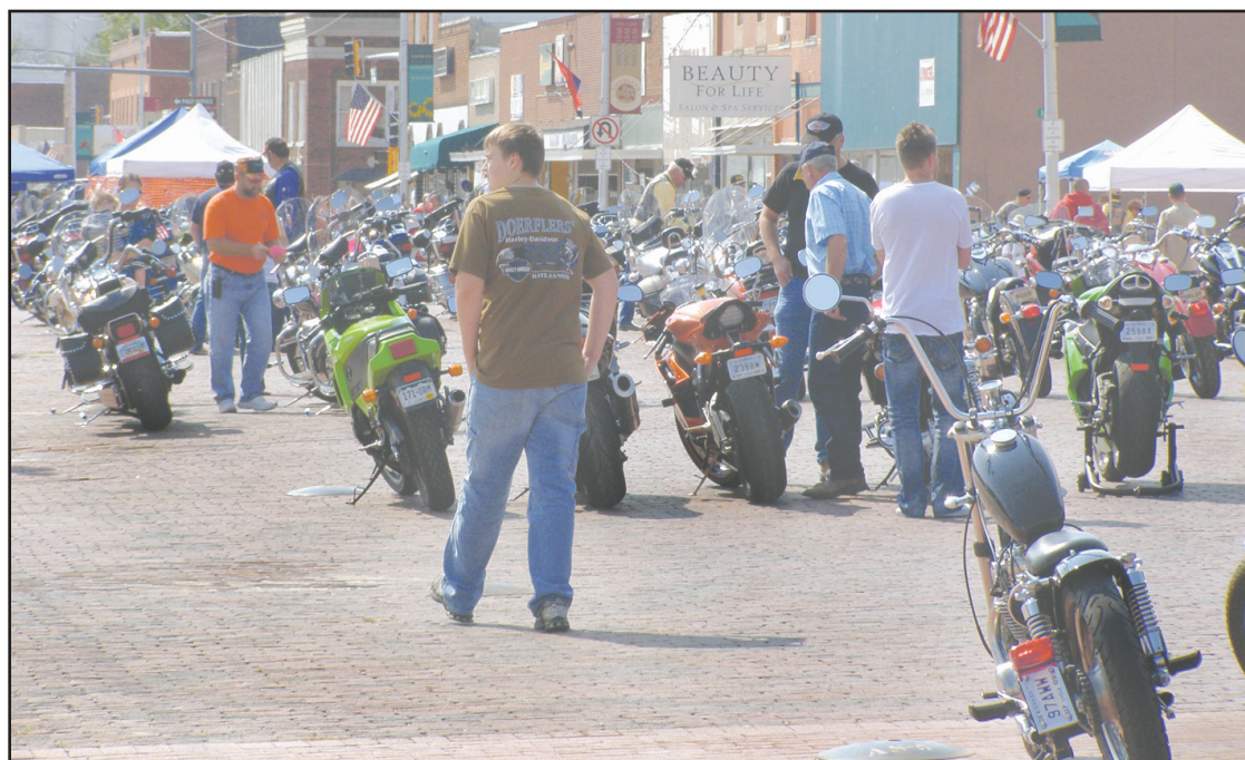
16th Annual Northwest Kansas Bike Show