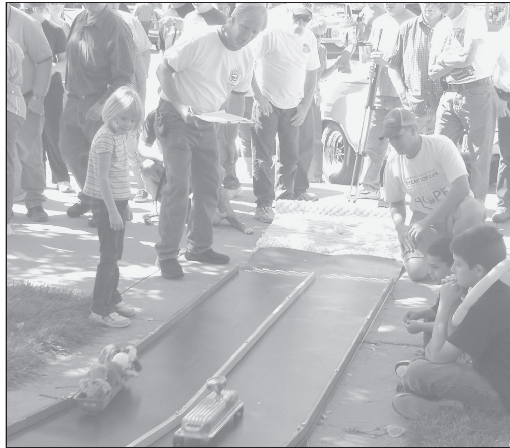
Waiting at finish line for valve cover race winners at last year's inaugural event.

Sunday morning the Brick Top Cruisers will have a Shine and Show from 8 a.m. to noon include the awarding of the prizes before noon. The car club people will have a fun walk and games from 9 a.m. to 9:45 a.m. Awards and drawings will begin at 10:30 a.m.