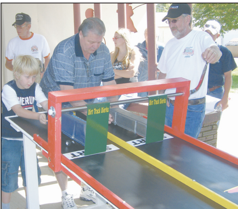
Second Annual Valve Cover Races