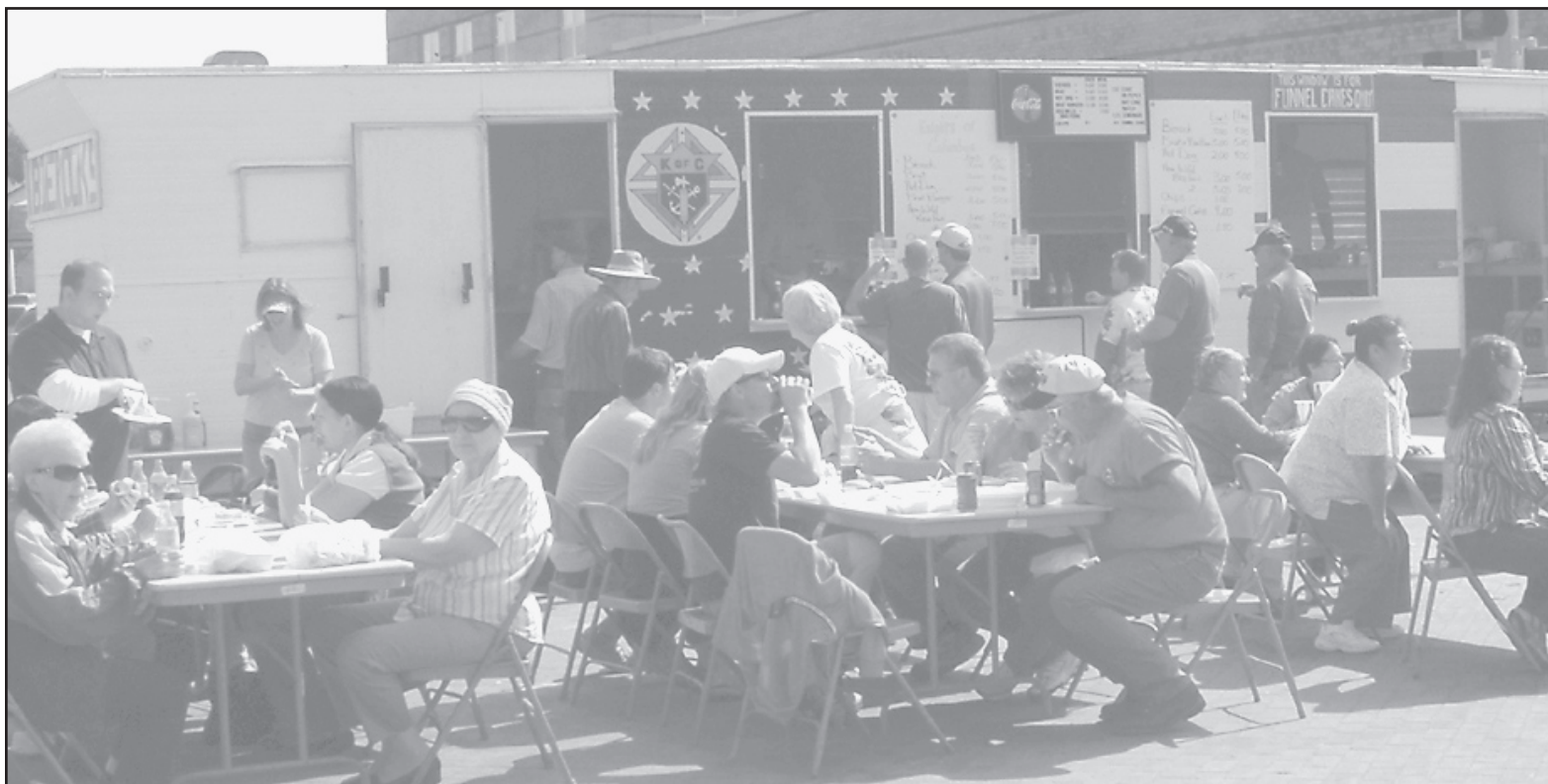
Food vendors selling all kinds of sandwiches, drinks and desserts are a big attraction on Main Ave. as part of the annual Flatlanders Fall Festival to be held on the street on Saturday, Sept. 25, from 10 a.m. to 4 p.m.