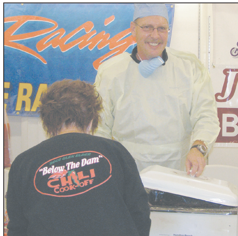
Frontier Ag Partners in Education Chili Cook-Off