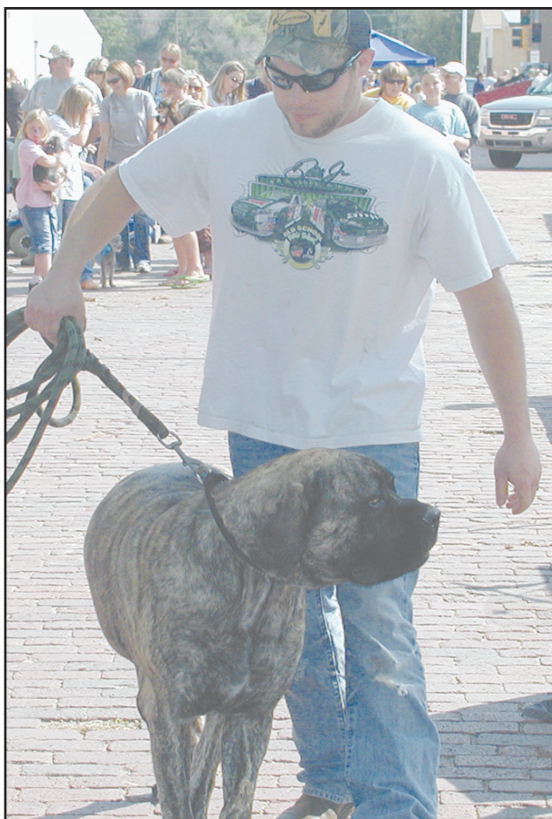
Scruffy Dog Contest