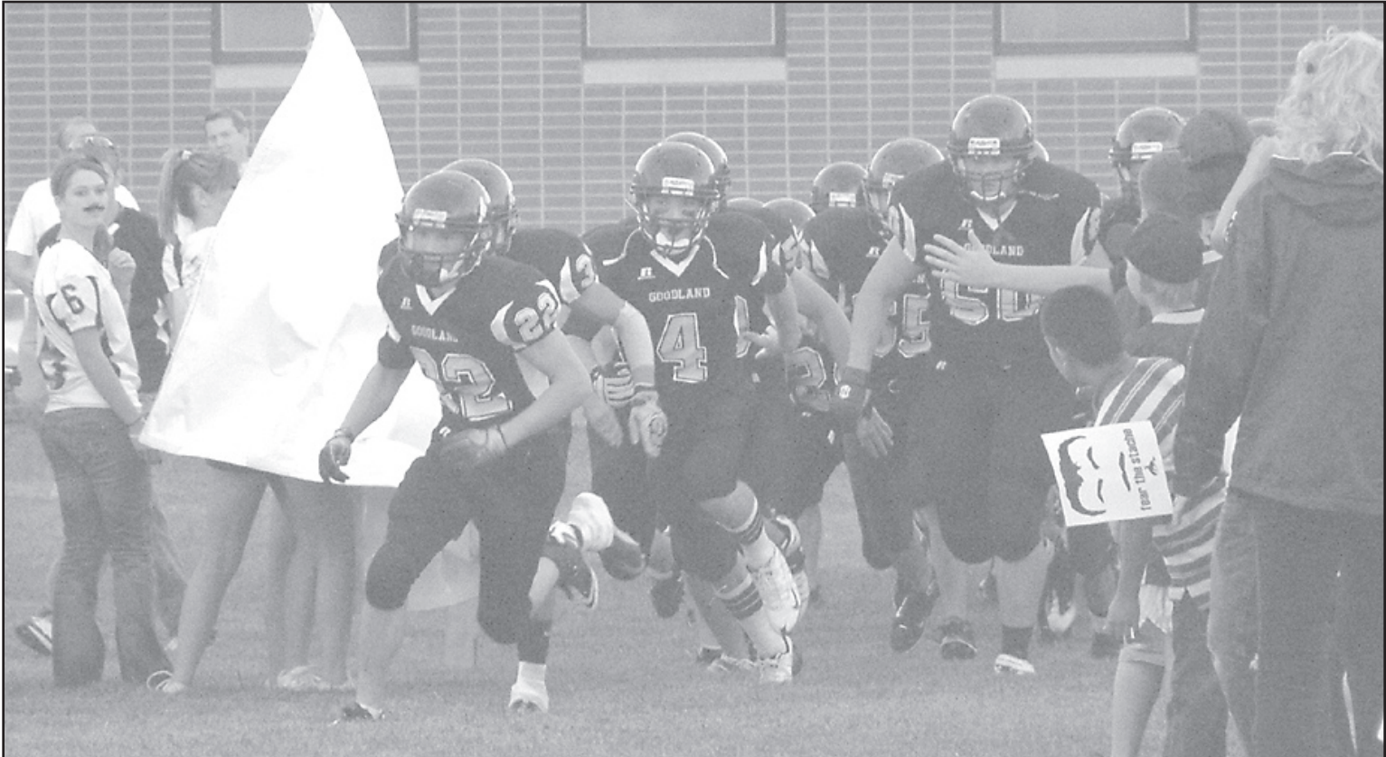
Goodland Cowboys broke through the banner and ran onto the field Friday for the home opening game against the Ulysses Tigers.