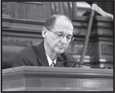
Rep. Morrison, shown here in the House Chamber at the Capitol, works diligently on multiple committees in the Legislature.