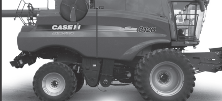
'09 Case IH 8120 AFX 733/975 hrs

ALL SELL WITH NO RESERVE! purple wave auction® 866.608.9283 purplewave.com