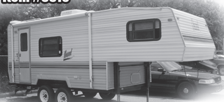
'94 Nomad 21' fifth wheel travel trailer

ALL SELL WITH NO RESERVE! purple wave auction® 866.608.9283 purplewave.com