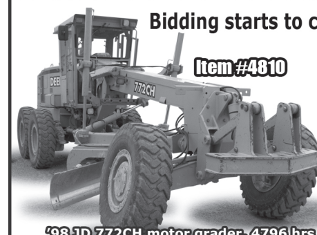
'98 JD 772CH motor grader, 4796 hrs