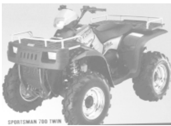
SPORTSMAN 700 TWIN