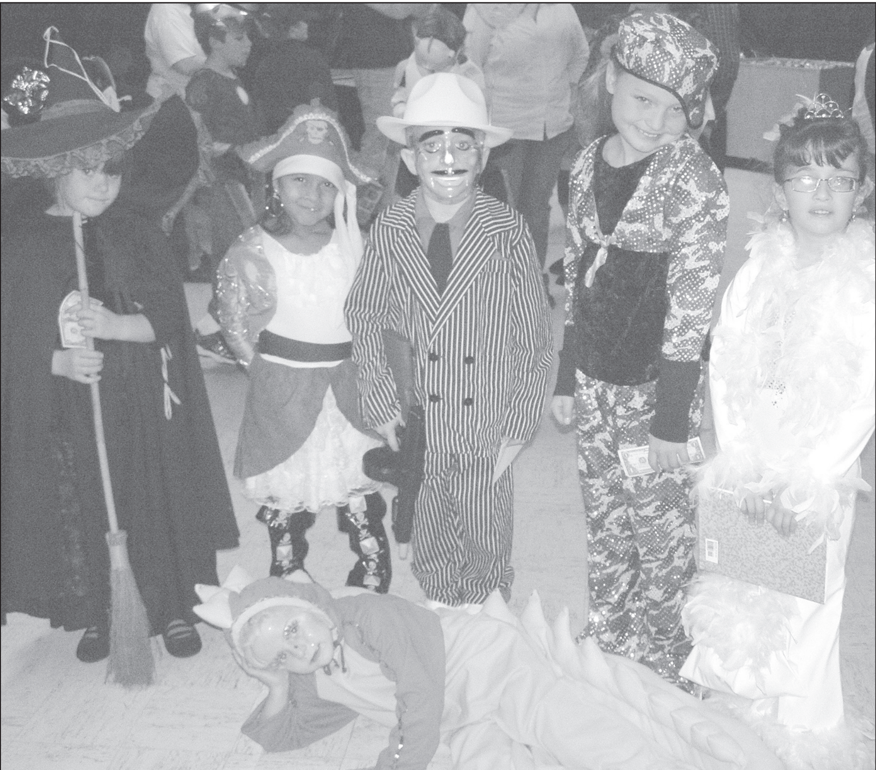
Winners selected by the judges in the 5 to 8 division

Other businesses who participated and handed out candy include Jacque's Hallmark, The Almond Tree, Smittee's Video and Jeff Juntiques.