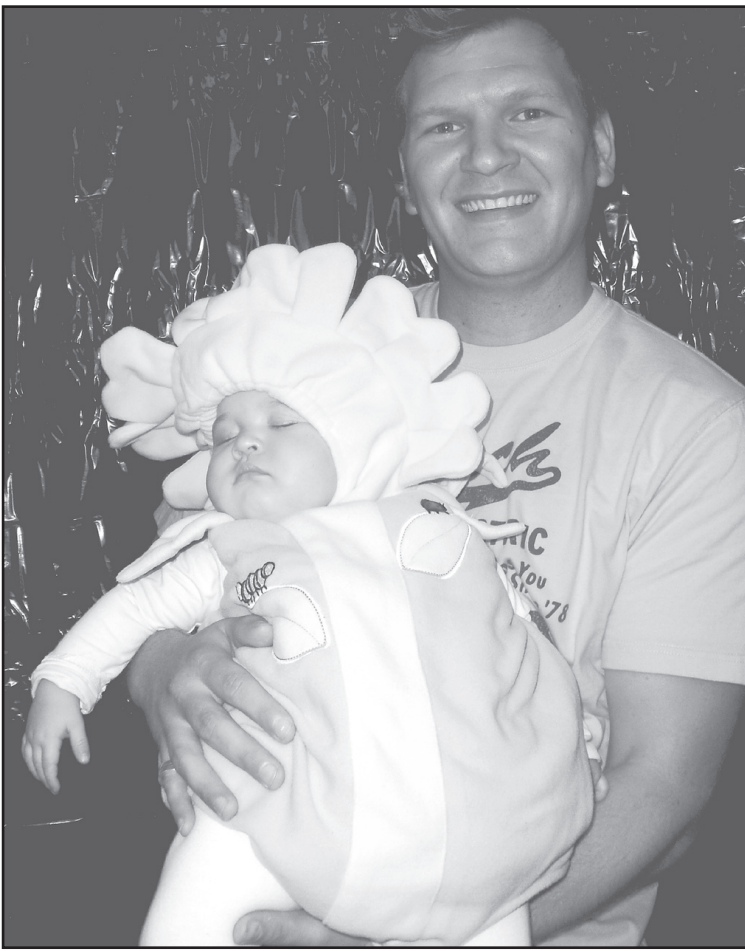
Winner in the 0 to 4 division