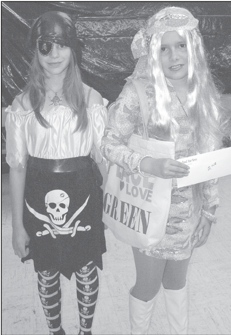
Winners in the 9 to 12 division