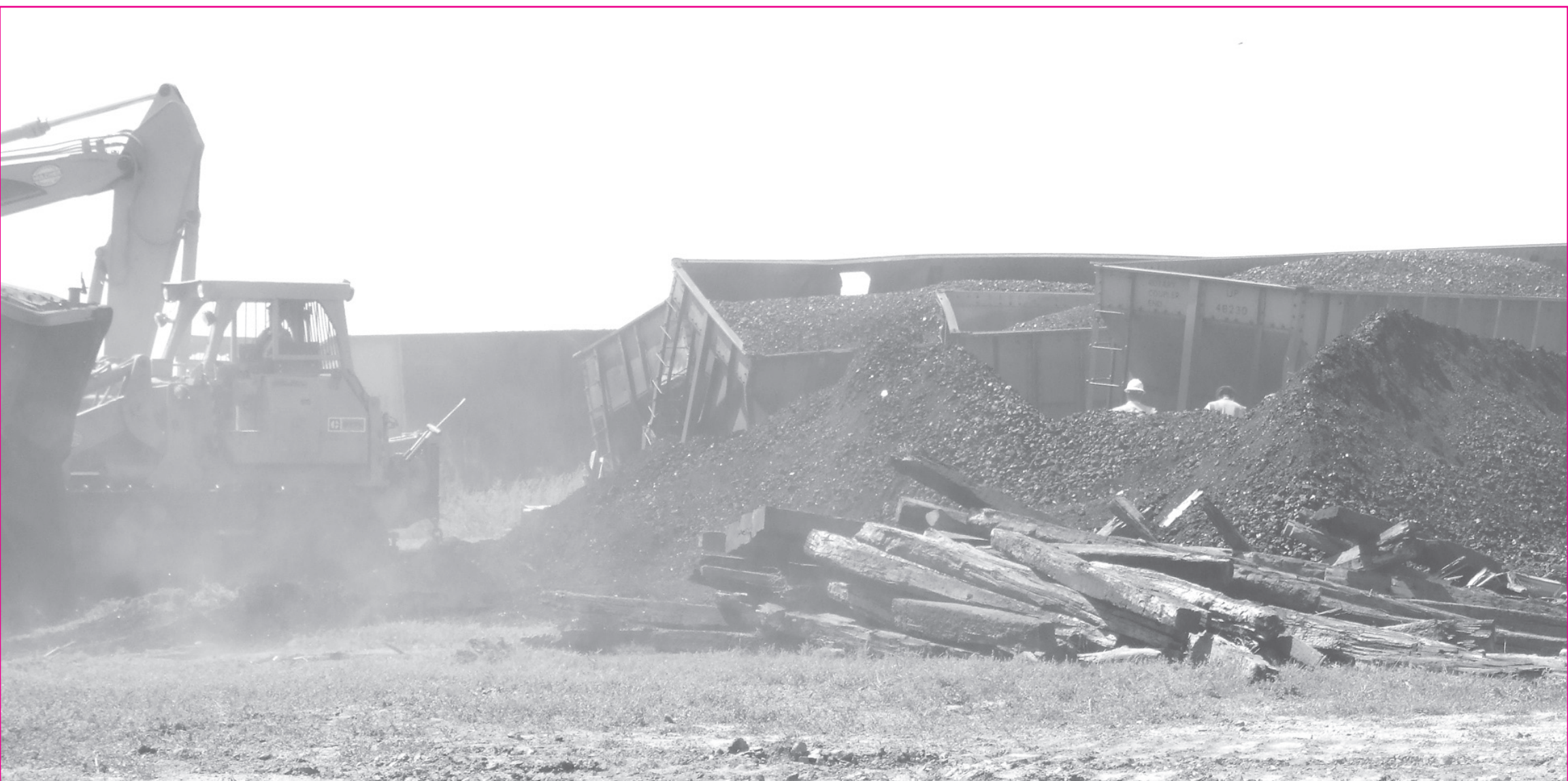
Workers from the Union Pacific railroad worked on cleaning up a train wreck west of Winona on Monday morning.