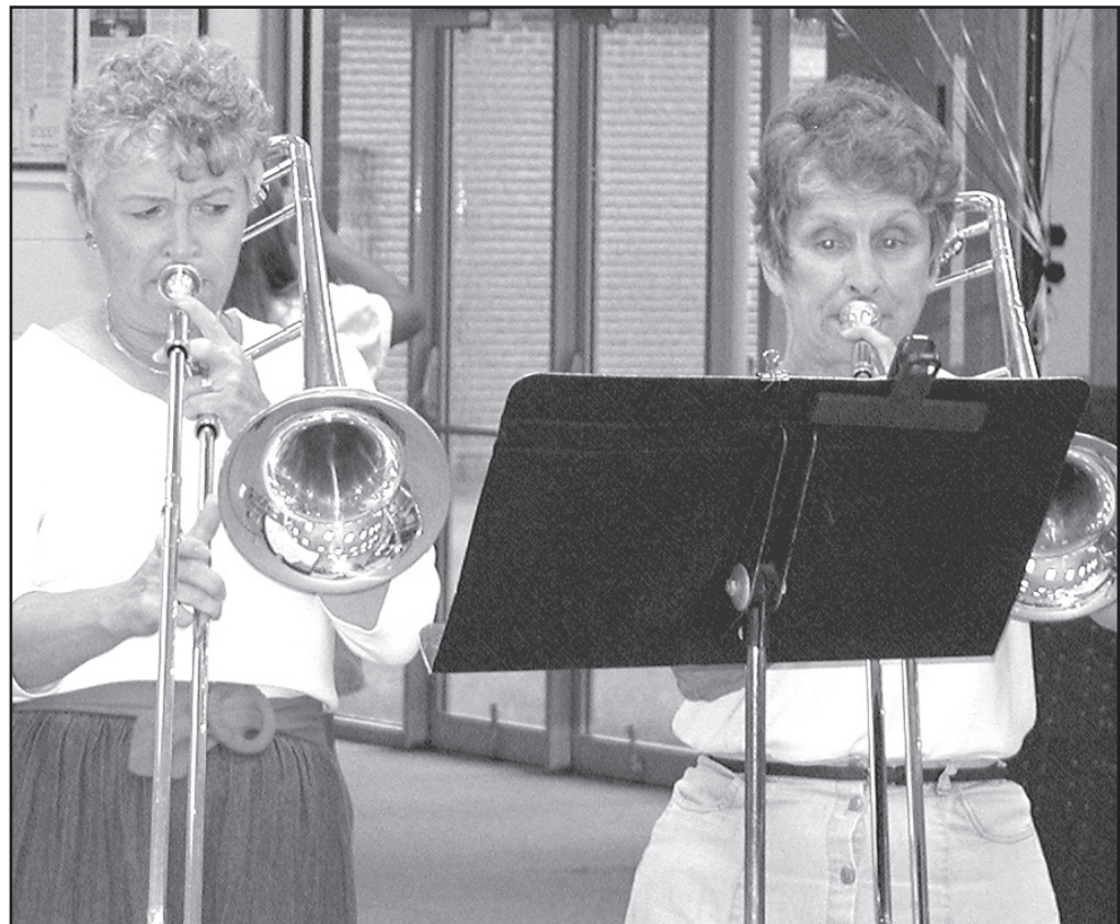
Members of the Circle and Square group from St. Francis performed musical selections as a band, chorus and dancing during the Relay for Life program on Friday.