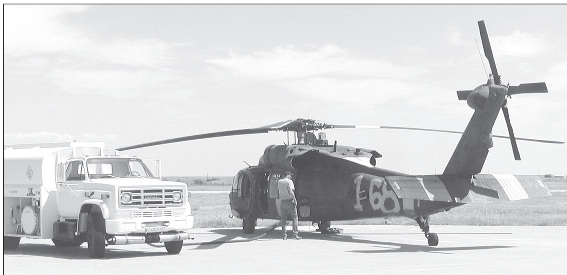
One of two UH60 helicopters from the Kansas National Guard landed at Renner Field in the past week to refuel and get some food from the Butterflying Cafe before heading onto Salina where they are stationed. The helicopters were helping fight fires in California and pink numbers were painted on the sides so the firefighters