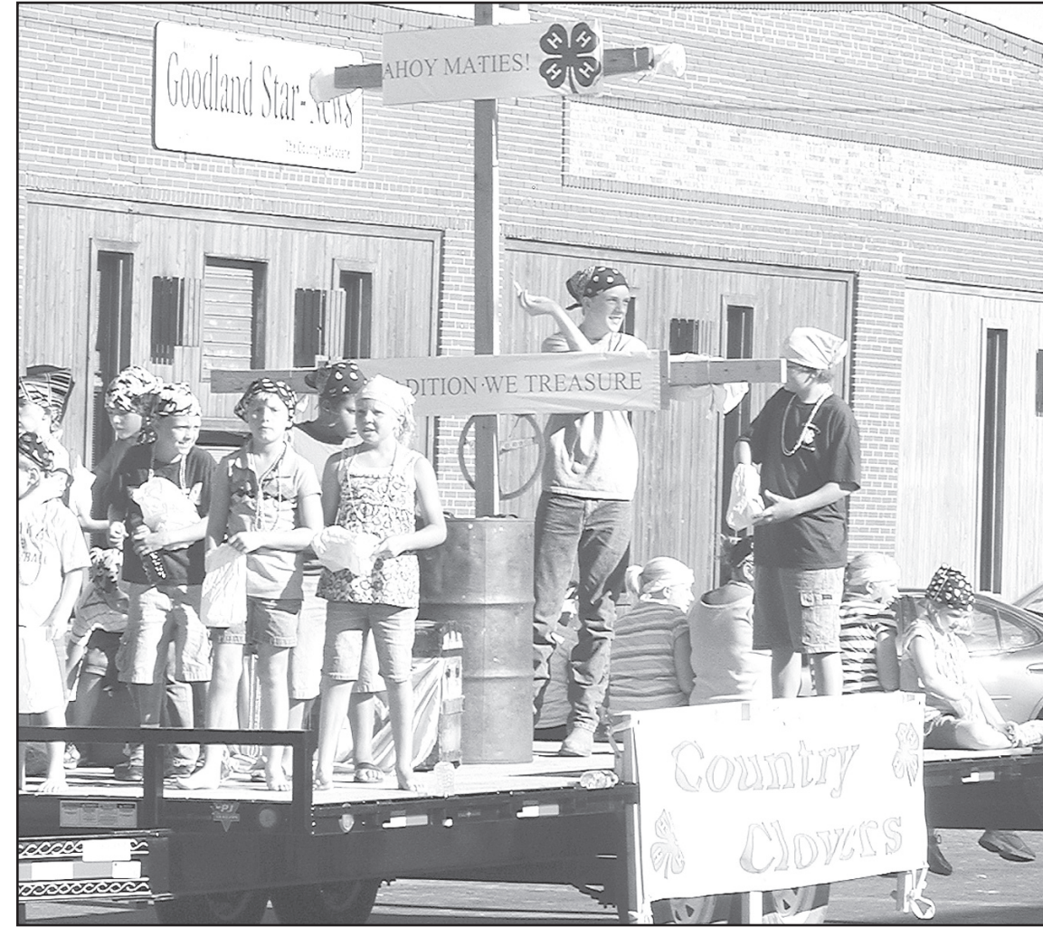
Third place 4-H float in the Northwest Kansas Free Fair parade Saturday went to the Country Clovers 4-H Club