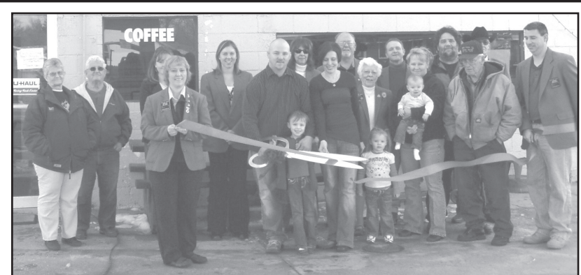
The Goodland Star News and the Goodland Area Chamber of Commerce and Ambassadors welcomes McB's Motor Company & McB's Sales