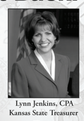
Lynn Jenkins, CPA Kansas State Treasurer

Join State Treasurer Lynn Jenkins, CPA in the Meadowlark Building at the Kansas State Fair to find out if you have any money or property being held by the State Treasurer's office!