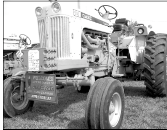
These tractors are similar to the four that were allegedly stolen including a 1973 International 1066 (top left), a 1984 Allis-Chalmers 8070 (top right), a 1976 John Deere 4630 (above left) and a 1963 Case propane tractor (above right).

The sentence in such a case could be up to 17 months in jail and a fine not to exceed $100,000 under state law.