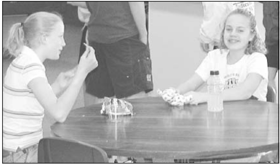
Two young guests enjoyed some refreshments at the Goodland Activities Center open house Saturday. More than 80 people visited the center to celebrate its 20 years of service to the community.