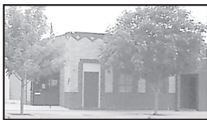
113 W. Washington, St. Francis, KS