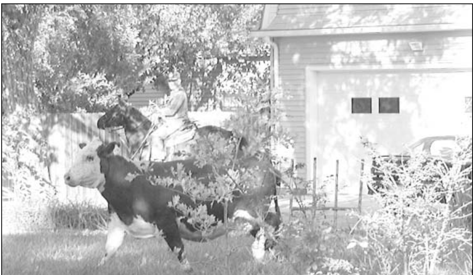
PATTY DECKER/Colby Free Press