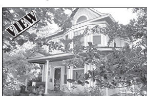
You will Fall in Love "One-of-A-Kind" 215 N. Garfield Call for Details