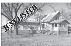
Country Living - 1.6 +/- Acres, 5BR, 2 Bath Home 2302 Co Rd 6, Brewster $99,500

Let us help you remove the guesswork and stress out of finding a top-performing real estate agent in your community. Simply call Stock Realty and Auction Co. to be connected with a top-performing, local expert with the in-depth market knowledge needed to sell your property. 785-460-7653 ... www.stockra.com