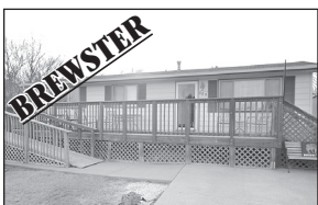
Price Reduction! 4BR, 2 Bath, 4 Garages