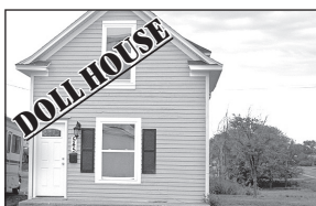
Grand New Look - Adorable & Ready for You 545 Martin $69,900