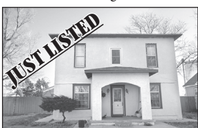
Great Value - Great Home, 5BR, 2 Bath, Outbuilding 685 N. Court $79,500