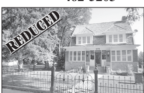
Reduced $30,000 - Beautiful 5BR, 3 Bath 375 W. 5th Call for Details