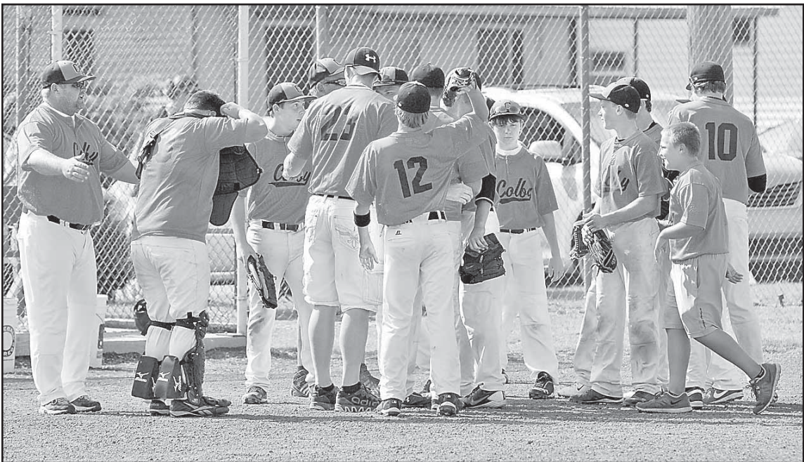
Colby players and coaches gathered to celebrate reaching Wednesday's K-18 state championship game at Lucas. It was the seventh state finals appearance for this program, according to available records dating back more than 60 years.