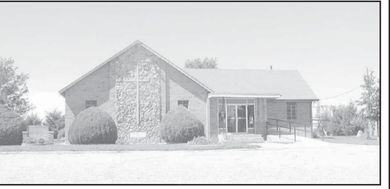
Levant Community Church