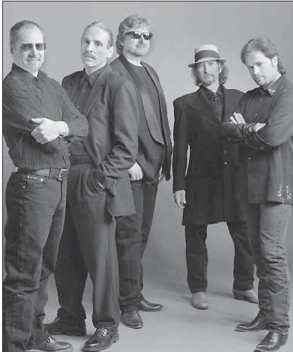
Country band Restless Heart will be on stage Friday night in the arena.