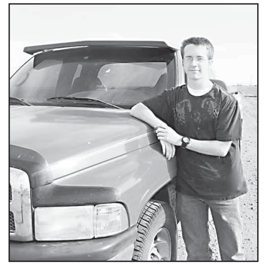
I plan to work for a yer then go to Northwest Kansas Technical College for auto collision and repair. Parents: Duane and Anglea Burkholder