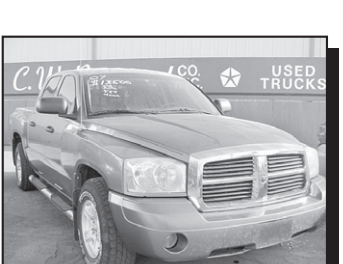
2007 • $13,500 Dodge Dakota V-8, Auto, SLT, 4x4, 4 Door