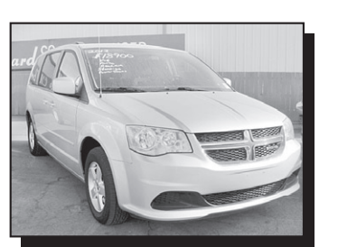
2012 • $18,900 Dodge Grand Caravan V-6. Rear A/C. Stow & Go. Power Doors