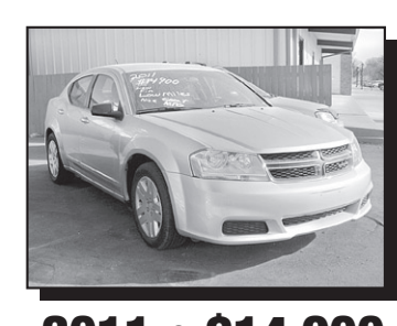
2011 • $14,900 Dodge Avenger Low Mileage, Great MPG