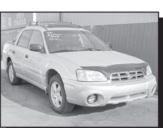
2006 • $13,900