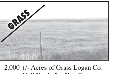
Call Kevin for Details