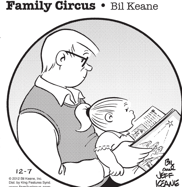
"Did Santa Claus and Jesus go to school together?"